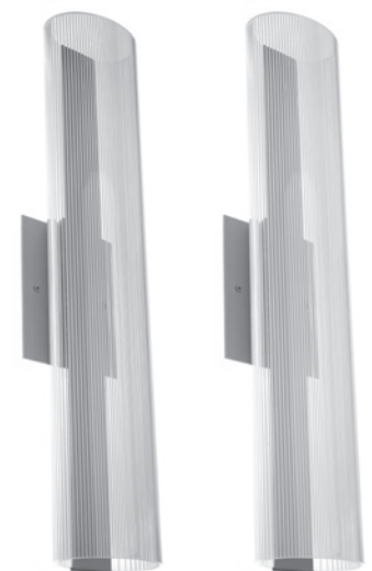
VERTICAL WALL SCONCE