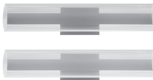
HORIZONTAL WALL SCONCE

Clear top and left Semi-Frosted bottom and right